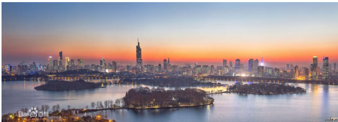
(One image of Nanjing)