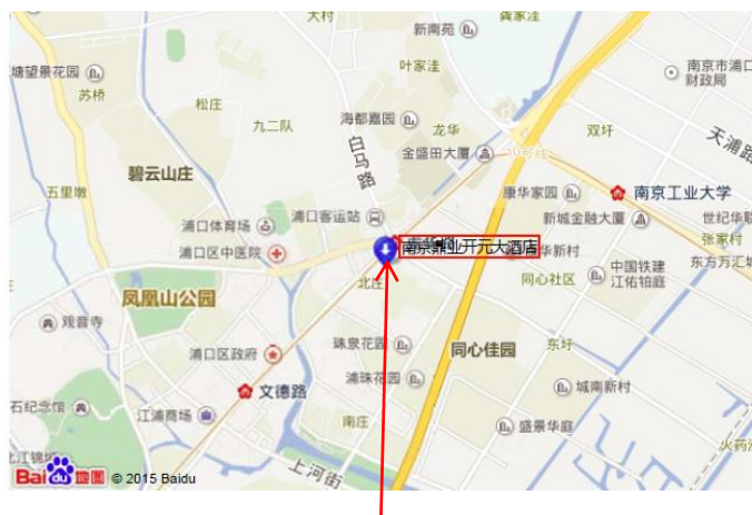
Conference site (鼎業開元大酒店)

Participants will accommodate in the above hotel during the Conference: