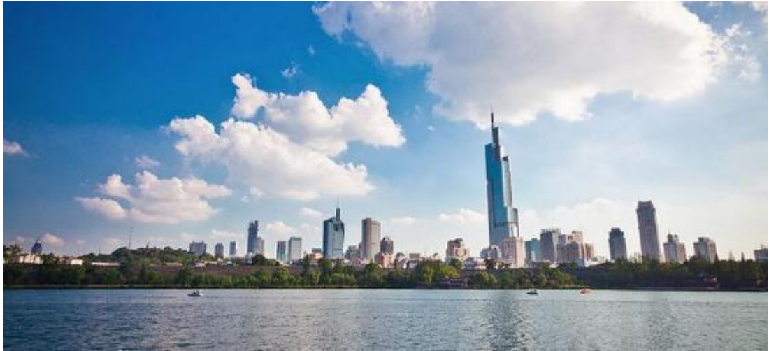
(One image of Nanjing)