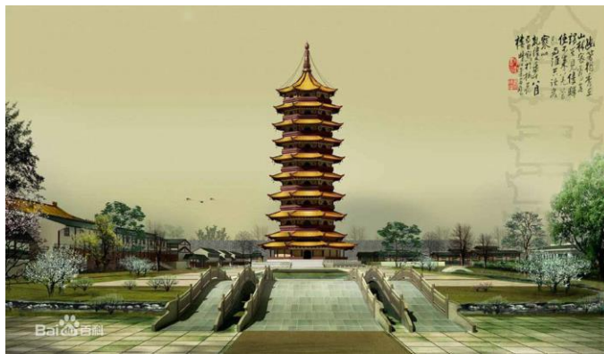
(Great Baoen Temple: 2 nd Temple in China, Started in A.D. 238, Renamed in 1412)