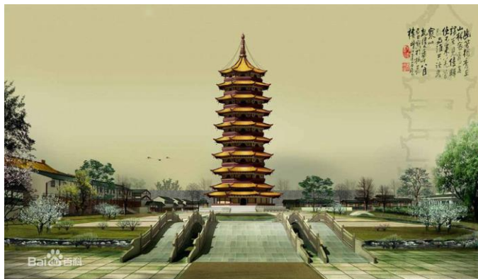
(Great Baoen Temple: 2 nd Temple in China, Started in A.D. 238, Renamed in 1412)